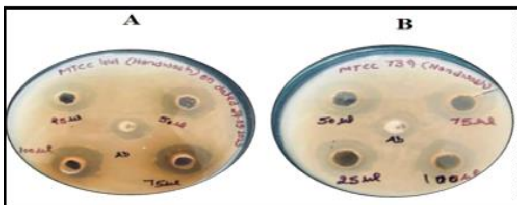
Fig. 2: Showing the zone of inhibition of Hand wash Formulation 1 containing the methanolic extract of O. tenuiflorum against B.subtilis (MTCC 441) E. coli (MTCC 739).

The antimicrobial activity of hand wash formulation 1 of O.tenuiflorum were checked against gram +ve ( B.subtilis ) and gram -ve ( E.coli ) by an agar well diffusion method. The result of zone of inhibition shows the significant antimicrobial activity. The zone of inhibition was measure with different concentration i.e. 25µg/ml, 50µg/ml, 75µg/ml, 100µg/ml of methanolic extract. The maximum zone of inhibition were observed 17 mm with concentration 100µg/ml against MTCC 441 as shown in Fig.2 and table 3 and 4.